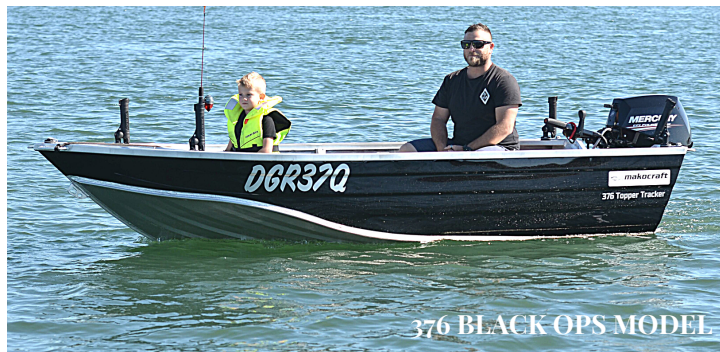
376 BLACK OPS MODEL

The Second generation "G2" Edge Bottom as designed by Tim Stessl is clearly visible on the bottom of every hull, it's a tri hull arrangement and under way it traps a cushion of foamy water beneath the hull that acts like a shock absorber. The "G2" Edge system also increases the surface area of the bottom of the vessel, therefore safety is increased, and as an added benefit, the boat floats in less water. In other words, Maokocraft Topper Tracker means stress free boating for you.